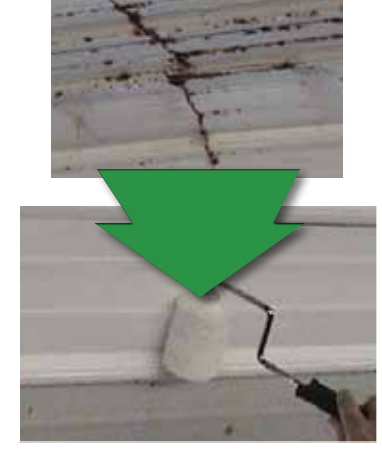
Don't wait until replacement is needed! Save time and money by repairing and protecting now!