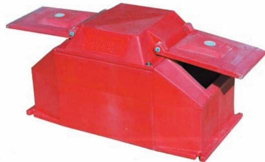
MPM10A 100% Energy Free Drinker

For use in flight pens or in other outdoor facilities, invert flaps.